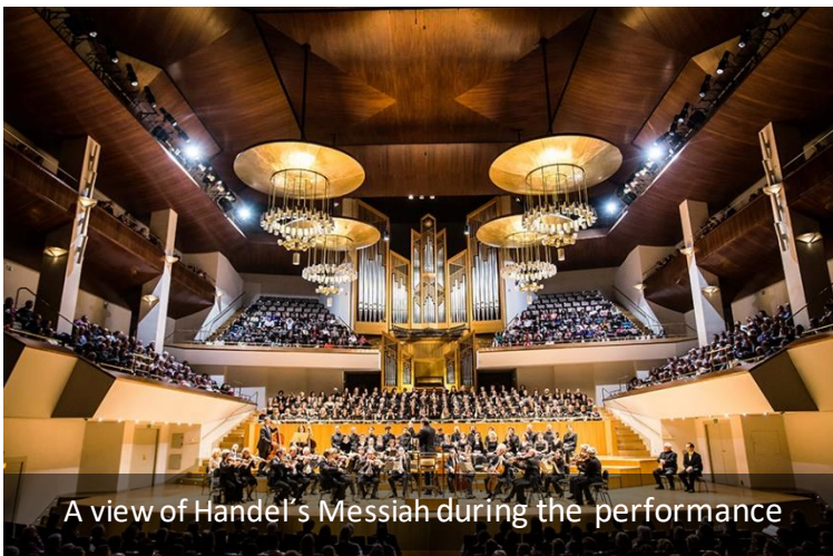
A view of Handel's Messiah during the performance

A fortnight (two weeks) before Christmas the community of the formation house had the opportunity to go to see a performance of Handel's Messiah at Madrid's National Auditorium of Music. The three-part performance lasted about two hours and was comprised of 53 movements or different songs. The first part told about the birth of Christ; the second part was about His passion, death, and resurrection; and the third part about His promise of eternal life and triumph over original sin. Every song was comprised of a quote from the bible that was sung either by a soloist or by the entire choir. It was also accompanied by an orchestra. The performance was absolutely incredible. Though it lasted two hours, every song sounded different and told its own story. The fact that it was in English also made it easier for the Americans to pay attention. It was amazing how the music came alive and how with just a few words from the bible, Handel was able to explain so much. As the Hallelu jah Chorus was sung everyone in the theater was on the edge of their seats as the entire chorus closed the second part of the Messiah.